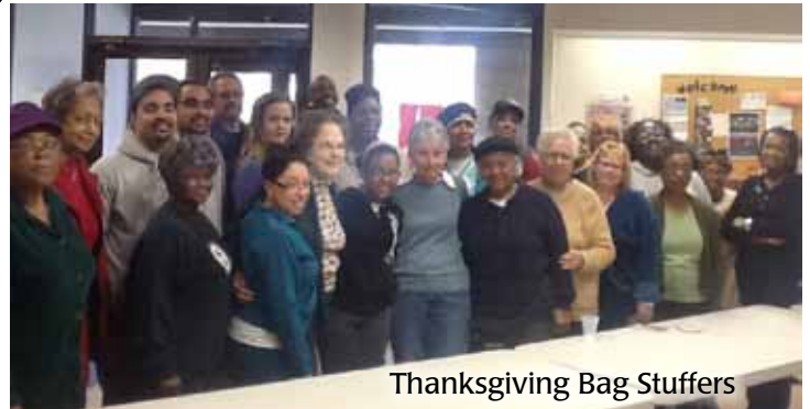
Thanksgiving Bag Stuffers