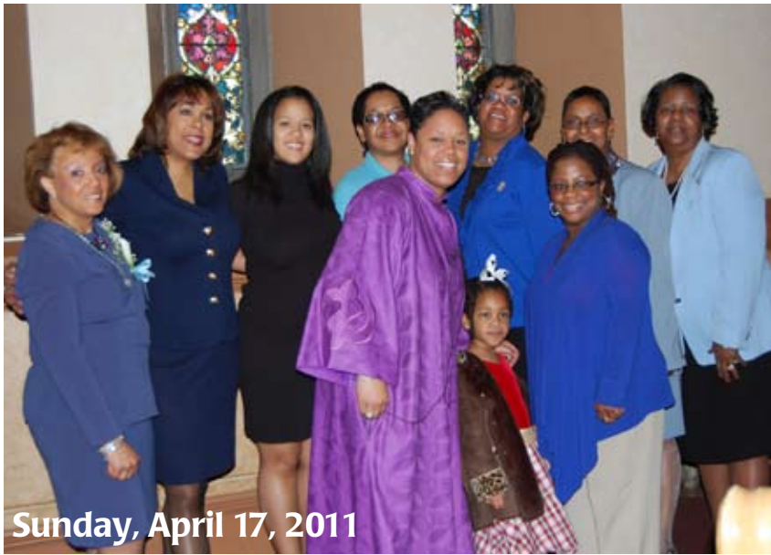
Sunday, April 17, 2011