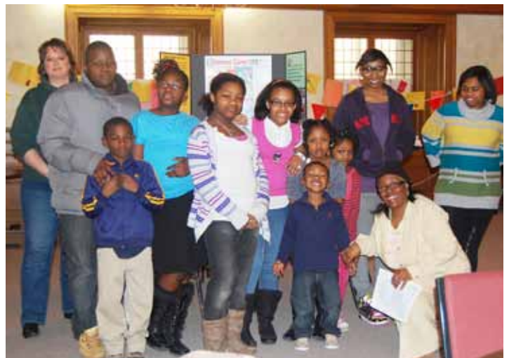
Sunday School students enjoy a summer camp presentation

Reports from Global Ministries mission partners in the region, further updates and donation information can be found at < ucc.org/disaster/japan-earthquake-2011/ >